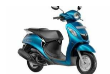
Yamaha to enter battery swapping technology with