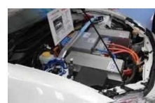
Companies may soon be invited to set up battery