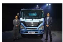
Eicher Trucks and Buses introduces