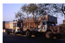
Revised axle norm, NBFC showdown